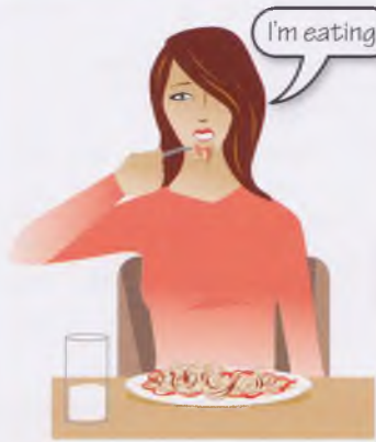
She's eating . She isn't reading.