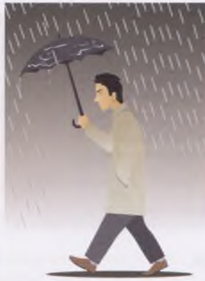
It's raining . The sun isn't shining.