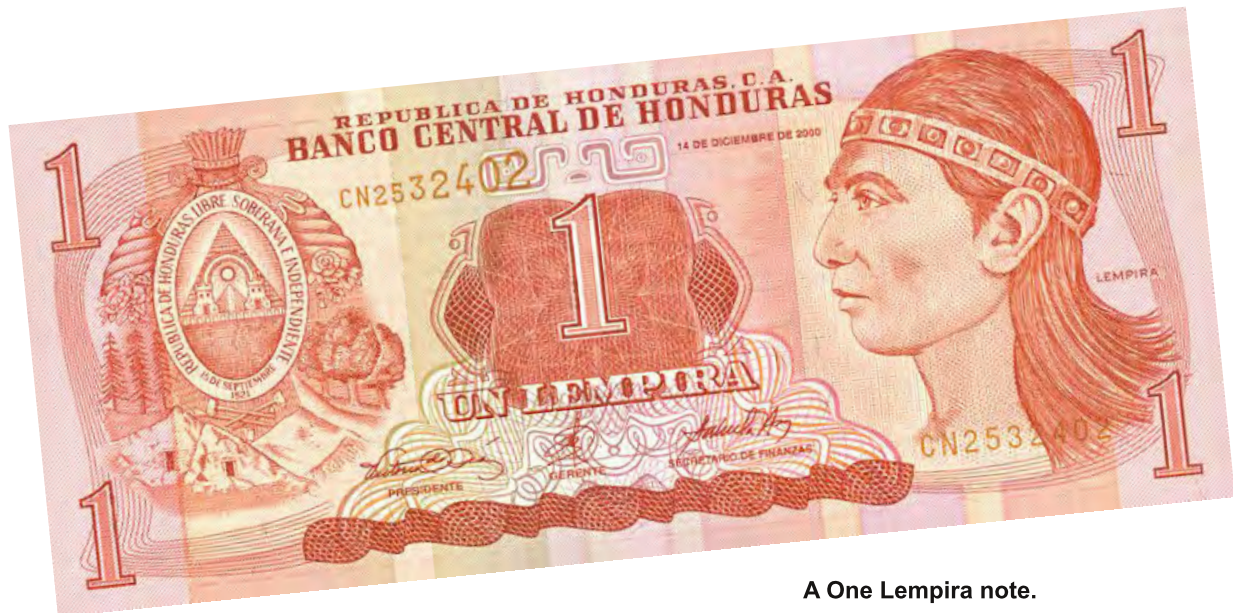
A One Lempira note.

Honduran coins come in denominations of 5, 10, 20 and 50 Centavos. They are attractive, but nearly worthless. In the past there were 1 and 2 Centavo coins, but those have been discontinued, as well as all coins made of silver. Most stores, except the large supermarkets, will not make change in coins, and just round the price up to the next Lempira. It is not unusual to find 5 and 10 Centavo coins lying in the street, abandoned or thrown away as worthless.