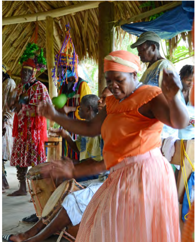
Garífunas in traditional costume.

These people are unique in the area and are well worth a visit.