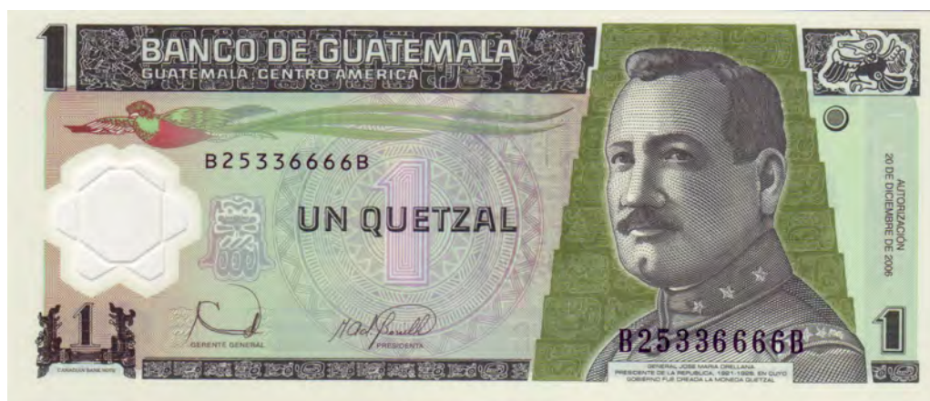
A One Quetzal note from Guatemala.

The exception to this rule of using Lempiras instead of dollars is if you should take a trip to Guatemala or Nicaragua. These countries are very reluctant to take Lempiras for any monetary transaction. They want only their own national currency, either Córdobas or Quetzales, but actually prefer US dollars. Their banks won't exchange Lempiras, nor will stores accept them, but will all accept dollars.