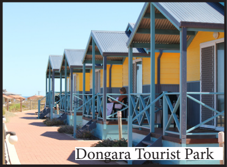
Dongara Tourist Park