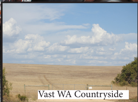
Vast WA Countryside