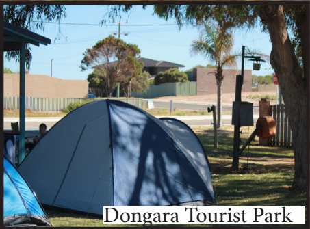
Dongara Tourist Park