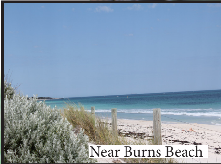
Near Burns Beach