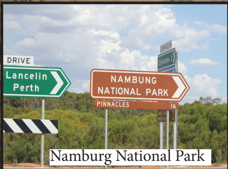
Nambung National Park