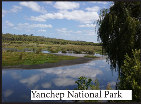
Yanchep National Park