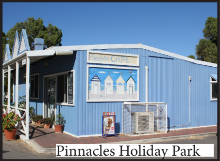
Pinnacles Holiday Park