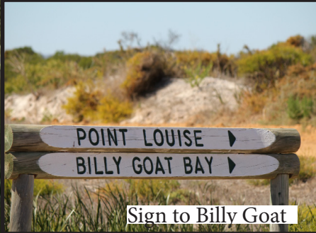
Sign to Billy Goat