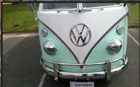
Happy Car Happy Travels