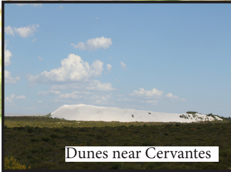
Dunes near Cervantes