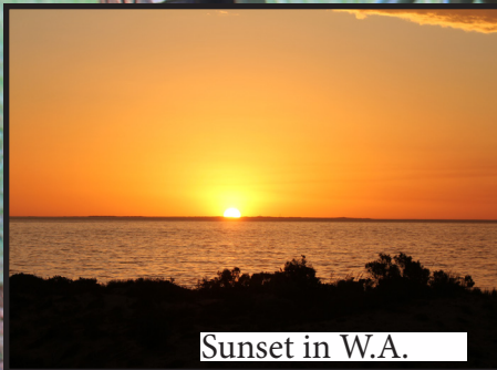
Sunset in W.A.