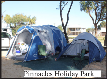
Pinnacles Holiday Park