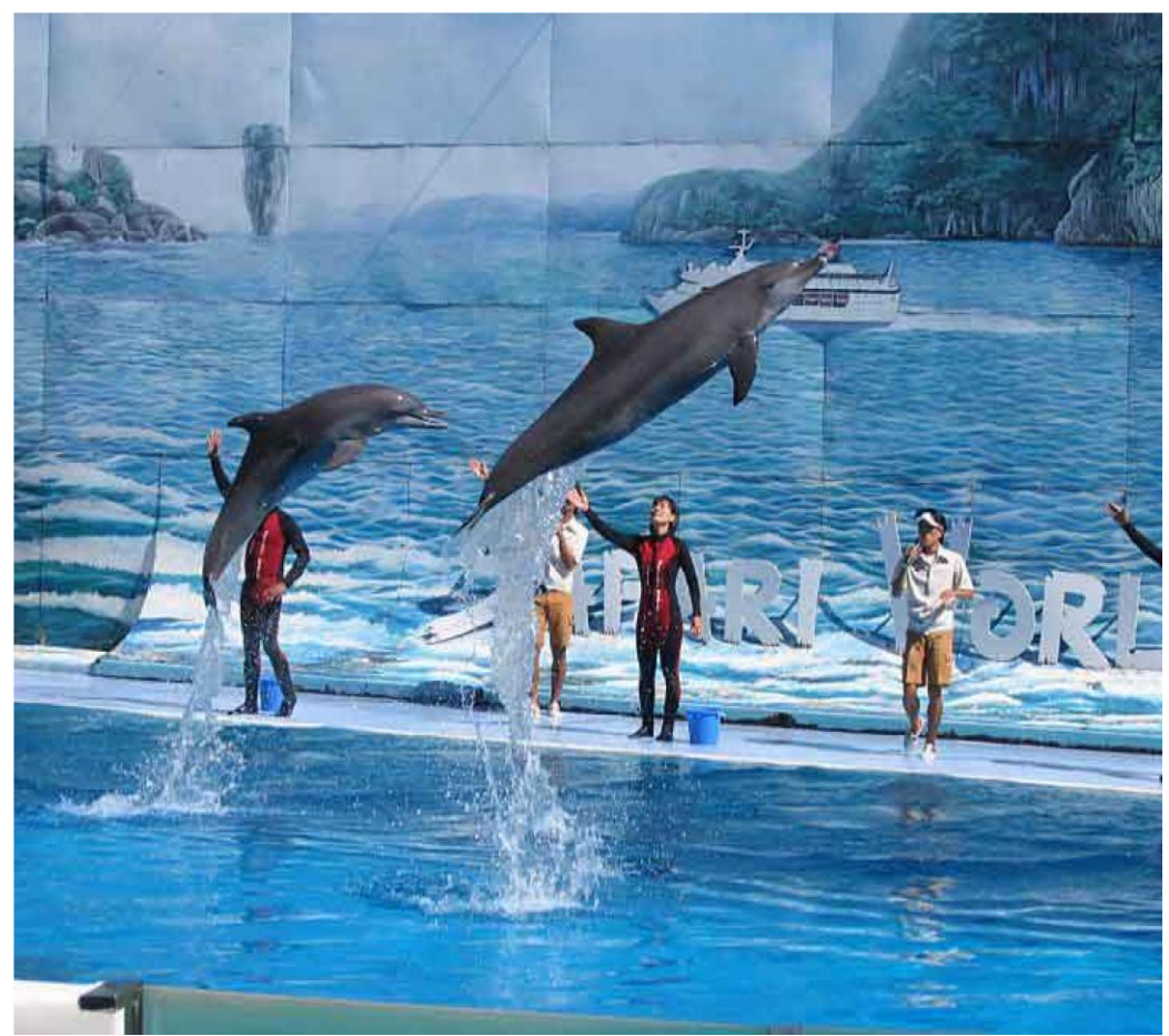
Tuan Chau entertainment center