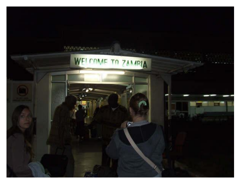
Arrival in Zambia