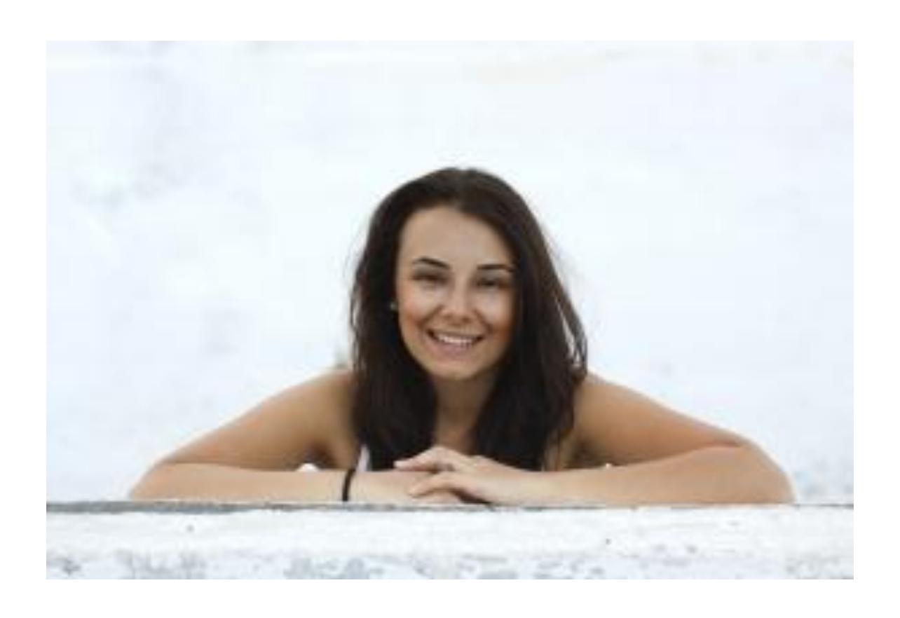
The Psychic Self Defense Strategy

Having a happy life and achieving your goals is something that you can easily do. All you need to do is learn some strategies in order to help you. The following book will provide you with steps on how to use the psychic defense strategy to live a happy life.