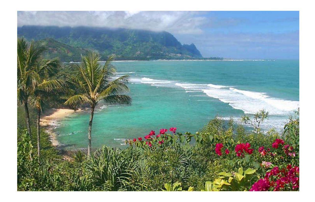
11:18 (Hawaii Time) Wednesday, October 14, 861 C.E. (Common Era) Southern coast of Oahu Hawaii Islands, Pacific

Jenna Chong, standing on the sandy beach next to her landed corvette, took in with delight a deep breath of the pure air brought in from the sea by a moderate wind. The beach she was standing on could also be described as 'perfect'. All in all, this cove on the southern coast of the island of Oahu could be rightly described as a corner of paradise. It also strongly reminded Jenna of her native world of Alpha Centauri A-2. That thought then brought tears to Jenna, as her native planet had been destroyed a mere four weeks ago, according to her personal biological clock, by those monstrous Morgs who had waged an extermination war against the worlds of the Human Expansion in the year 4021 C.E. Over two billion Centaurians had perished in the destruction by the Morgs of the Alpha Centauri System, along with nearly a fifth of a million men and