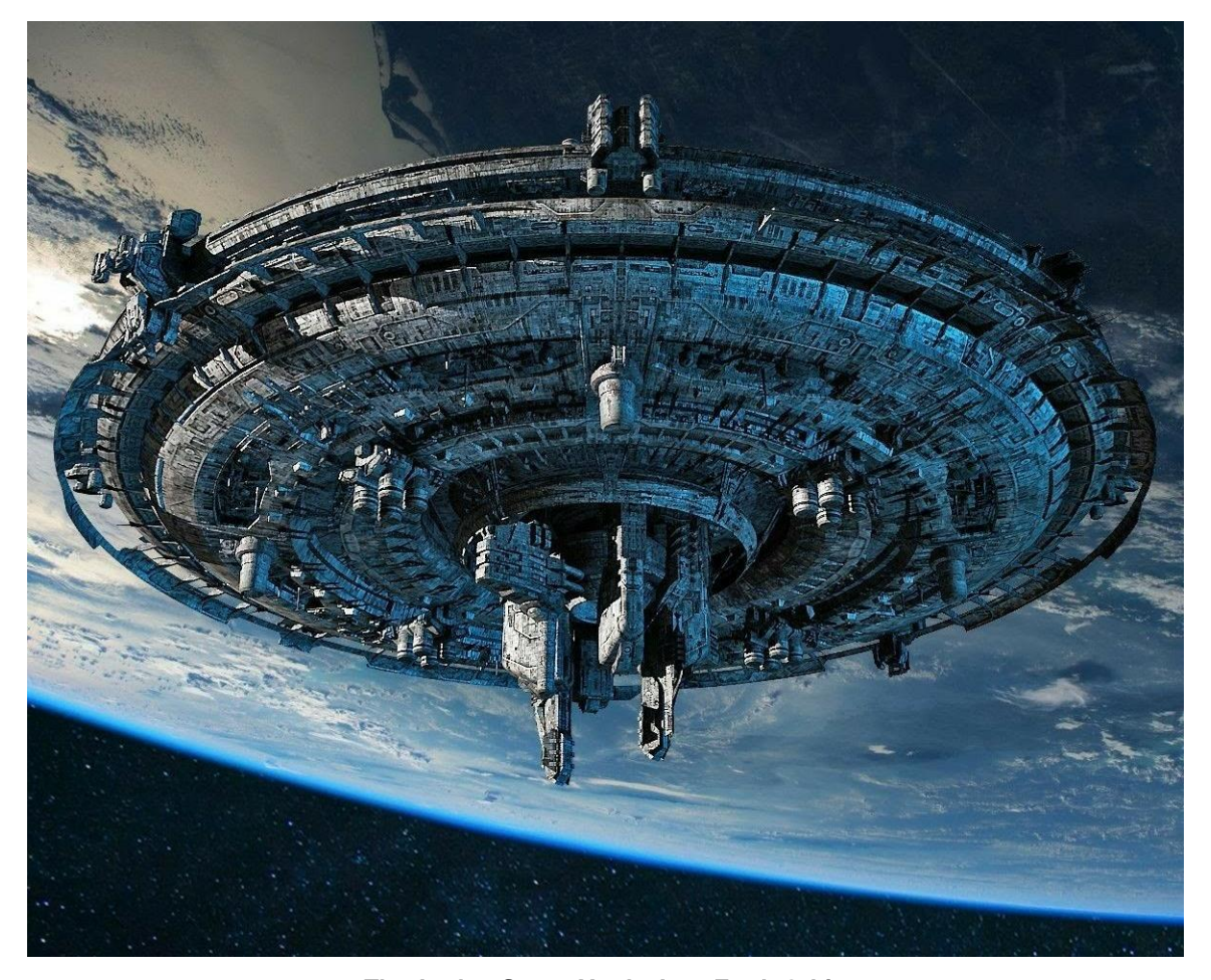
The Avalon Space Yards, Low Earth Orbit.

19:38 (Universal Time) Monday, November 4, 2335 Avalon Space Yards, Low Earth Orbit Solar System