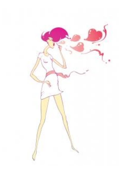
Perfect First Date

There are usually a lot of emotions and thoughts surrounding the times before and at the onset of the first date. While attempting to sieve through all these, the individual would also have to make the necessary preparations to ensure the date goes well, while ensuring, the possibility of getting a second date is sealed. These are all fairly difficult and stressful elements to consider, especially if the individual does not consider himself or herself a confident, impressive and totally capable date partner. Get all the info you need here.