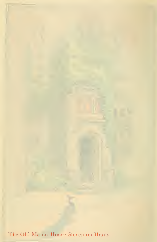
The Old Manor House Steventon Hants