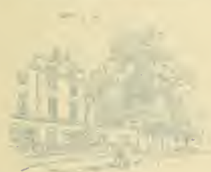
The Home of Great Miss Austen