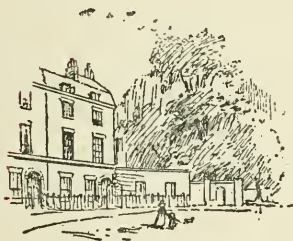
The House in Hans Place, London.

With Colored Illustrations by C. E. and H. M. BROCK