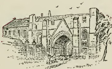
The Abbey Gateway and Abbey School at Reading.