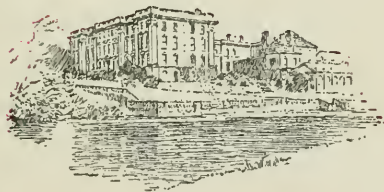
Stoneleigh Abbey, Warwickshire