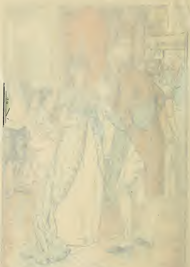
Elinor perceived Willoughby in earnest conversation with a very fashionable-looking young woman (page 13)