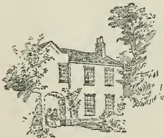
Ashe Rectory, near Deane.