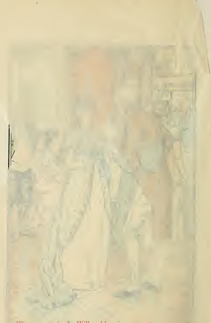
Elinor perceived Willoughby in earnest conversation with a very fashionable-looking young woman (page 13)