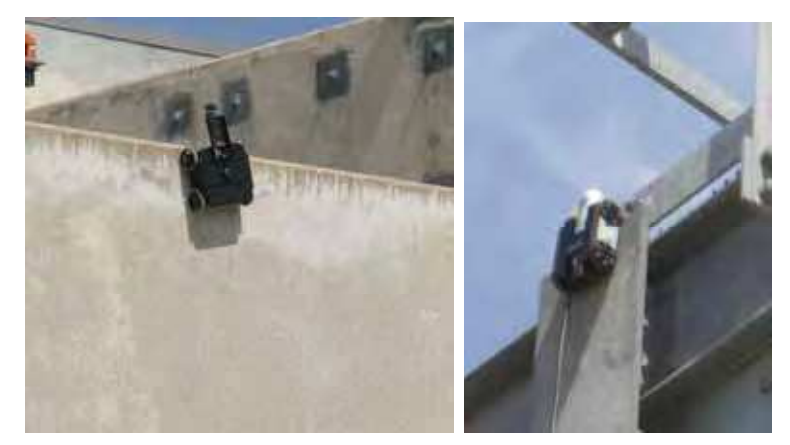
Fig. 5. Examples of wall-climbing robots