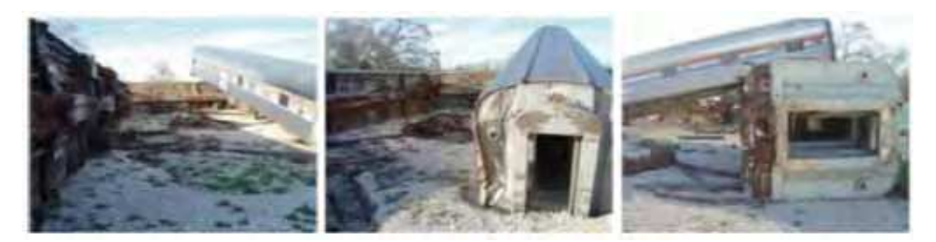
Fig. 7. Train Wreckage Scenarios

Passenger rail cars were hit by industrial hazmat tanker cars of unknown substance and both trains partially derailed, as shown in Figure 7. After initial analysis, it was determined that ground robots should circumnavigate all trains over the tracks, various debris, and rubble. The robots should map the perimeter along with the location and positions of each car, including under the elevated car. Robots should search the Sleeper Car ramping up from the ground, and search each curtained alcove on both sides looking for simulated victims. For the Crew Car on its side, robots should be inserted to explore the interior to locate any victims or read the placards on hazardous canisters that may be in the mailroom. Access to the mailroom is too small for a responder in Level A suit.