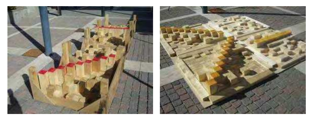
Fig. 2. Step Fields Provide Reproducible Terrain Challenges

"orange") provide orientation complexity in static tests, such as Directed Perception. Fullcubic step fields ("red") provide repeatable surface topologies for dynamic tests, such as for locomotion. The sizes of the steps and width of the pallets are scaleable according to the robot sizes. Small size robots can use pallets that are made of 5 cm by 5 cm posts. Midsized robots can use pallets made of 10 cm by 10 cm posts. Large-sized robots use pallets made of clusters of four 10 cm by 10 cm posts. The topologies of the posts can be biased in three main ways: flat, hill, and diagonal configurations. \check{Z}