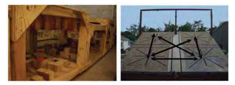
Fig. 3. Example Mobility Tests. Left: Confined Space Cubes; Right: Inclined Plane with waypoint pattern

marked on a ramp (at a variable angle), which the robot is to follow on an inclined plane. Ability to do so and time to complete is noted for each angle, which is gradually increased until the robot may no longer accomplish this safely. For robots that are able to climb walls or move while inverted, the test can be extended to accommodate these configurations. For the mobility on stairs, the ability of the robot to ascend and descend several flights of stairs