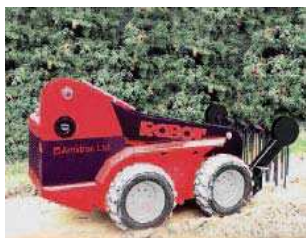
(a) Armtrac 25. (Armtrac Ltd., United Kingdom)

Light flail machines have difficulties to operate with precision from a long distance (this applies to all remotely controlled machines), as they require line of sight operation with suitable feedback. The ground flailing systems create large dust clouds and the high vegetation will restrict operator's view on the machine. They also exhibit difficulty in flailing in soft soil, and can inadvertently scatter mines into previously cleared areas. All machines are not intended to be used in areas where AT mines are present, and they may not be usable in steep or rocky terrain.