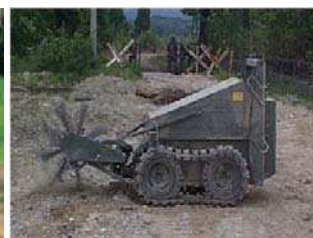
(c) Mini-flail. (US Department of Defense)