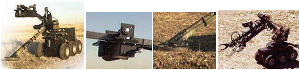
(a) The MR-Robot. (b) Laser/US imaging. (c) Metal detector. (d) MR-2 with MR-1.

adaptively follows the terrain surface while avoiding obstacles. MR-2 can perform neutralization of landmines using MR-1 arm under the supervision of remotely located operator. MR-1 is a ragged modular dexterous robotic arm (See Fig. 3). The ROV is capable of turning 360 degrees in 1.5 m wide hallway, traversing virtually any terrain up to 45 degrees in slope, over 70 cm ditches, curbs, etc. It operates either with wheel or track and quick mount/dismount tracks over wheels. MR-2 works at high-speed scanning (up to 5 km/hour) with wide detection path (about 3 m). The MR-2 is an autonomous mine detection system that operates at high speed with minimum logistic burden. The MR-2 is a high cost and heavy robot that is designed to search for mines in terrain with rich vegetation stones, sand, puddles and various obstacles. The open architecture of MR-2 allows expansion with generic and custom-made modules (semi-autonomous navigation, pre-programmed motion, landmine detection, etc.). Sensor payloads can be extended to include a metal detection array, an infrared imager, GPR and a thermal neutron activation detector. Data fusion methodologies are used to combine the discrete detector outputs for presentation to the operator. No evaluation and testing results in relation to demining are available.