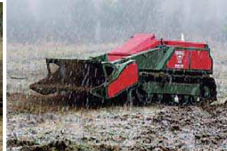
(f) The MV-4. (DOK-ING d.o.o., Croatia)