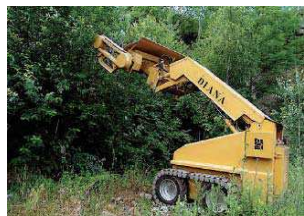
(d) Diana 44T (Hontstav S.R.O., Slovak Republic)