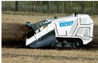
(e) Minecat 140. (Norwegian Demining Consortium)