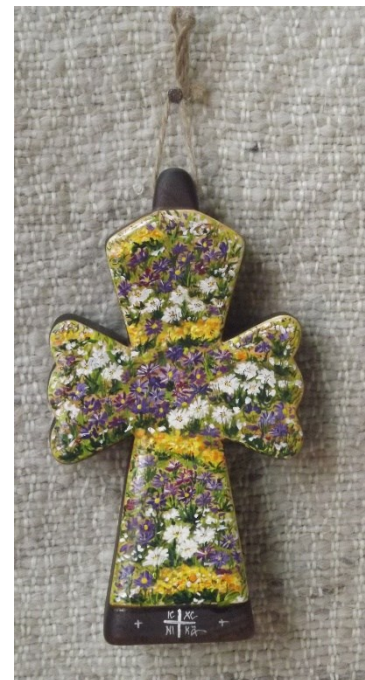
Cross carved in walnut, created in the monastery workshop

People, you should stay into your nest flying as I have counseled you, for the idols of today have a hidden work, son. And when you leave, put the cross around you, as the child Joseph did in the middle of Egypt, without being enchanted by any things from Egypt . That is why I prepared the teaching for you beforehand, for you saw that even the good brothers sold their brother, and I have exhorted you