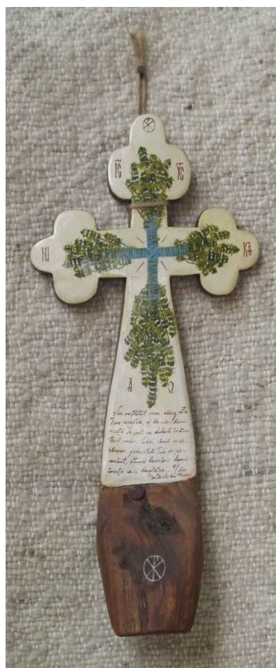
Cross carved in walnut, created in the monastery workshop

Oh, My people, you, who cannot give up the things that you like; you had better have Me as your wealth. Do you see son, that I got rid of the meanness that I found into your house for Me. You had Me stay on a worldly bed, on a sinful bed. You had Me sit at a high table; you had sit on a worldly throne, and I was hanging on your wall with My image multiplied for selling, dressed in red chlamys, as a sign of crucifixion, as a sign of slavery. (In the written icons, instead of being painted, and the Lord appears crucified or dressed in red purple, a garment received from Romans as a mockery, r.n.). I want to get you used to the holy things, but you should not take anything without blessing; you should not steal the craftsmanship without having a calling for the holy things, as the Israel people received them from Me through Moses. Help Me work with love on you, as if you also make Me bow to your petition now, you will back off and not grow up. Set yourself to a holy propriety, as you do not know what I ask