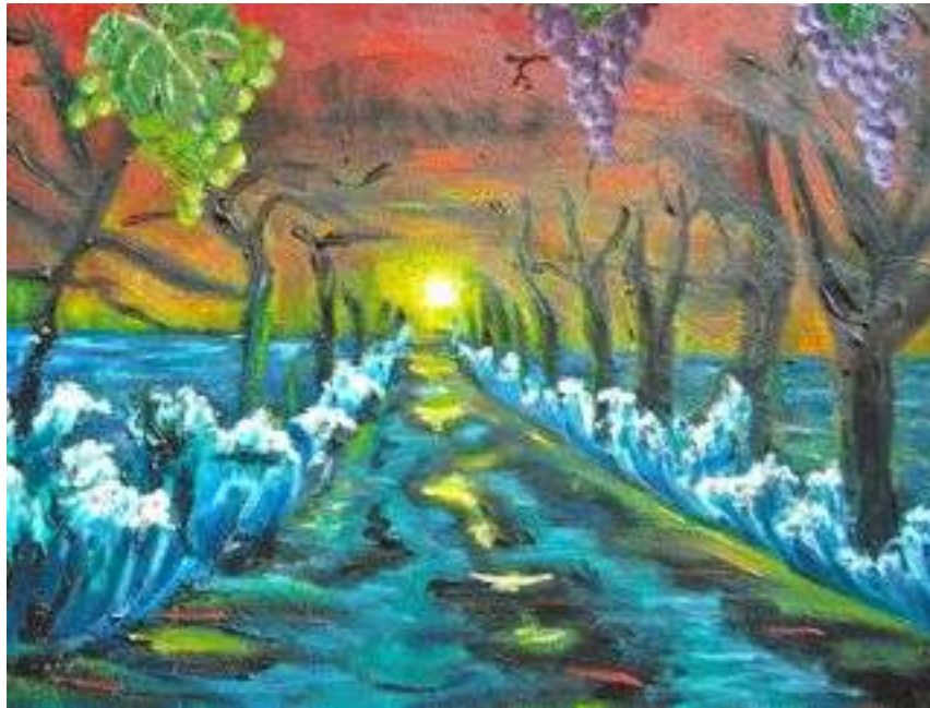
Place of Surrender – Artwork by Colleen Archibald