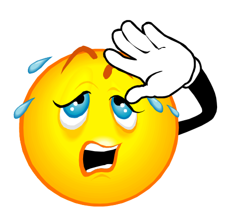
Before you go to bed