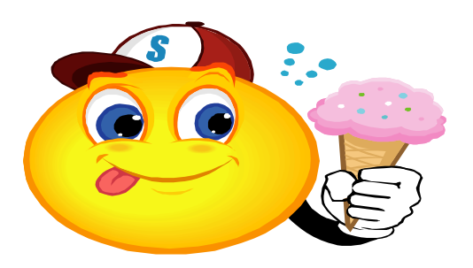
Before you eat