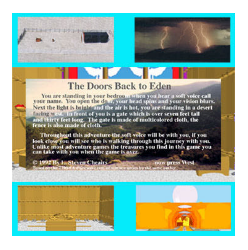
The Doors Back to Eden is a Christian adventure video

The Doors Back to Eden is a Christian adventure video game which is carefully designed to teach Bible truths in a very enjoyable way. The game starts in the desert and ends in heaven eternal. The game comes