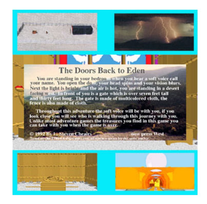
The Doors Back to Eden is a Christian adventure video

The Doors Back to Eden is a Christian adventure video game which is carefully designed to teach Bible truths in a very enjoyable way. The game starts in the desert and ends in heaven eternal. The game comes