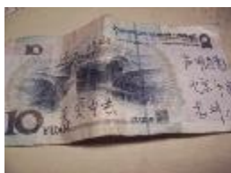
Falun Gong slogans written on the paper currency

"Some people have suggested writing 'Falun Dafa is good' or 'Quitting the Party' on Renminbi. I think that's a good idea. You can't throw away money, and you can't destroy it."