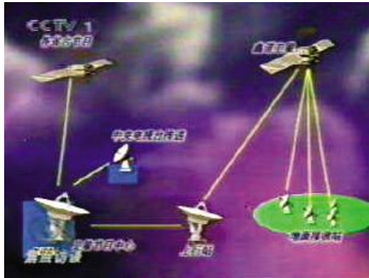
Sketch of Satellite Sino I Transmission

※ According to UN Charter and relevant conventions and radio regulation of the International Telecommunication Union, it is illegal to deliberately disrupt or jam normal satellite TV broadcasting.