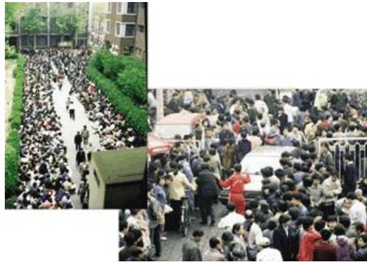
Falun Gong practitioners illegally besieged Tianjin Educational College.