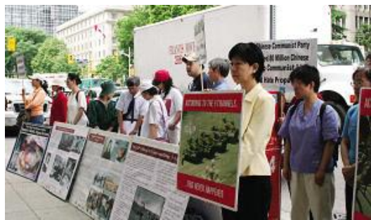
Falun Gong grouped the followers to demonstrate before the Rogers Cable Headquarters in Toronto.

The Great Wall Platform cooperated with Rogers Company in scrupulously selecting 9 representative channels from 17 channels of the American Great Wall Platform. The Rogers Cable agent is left to apply with the CRTC for the entitlement to the program trans-broadcasting. Such a local Chinese cultural and recreational affair was obstructed by Falun Gong by every means. Between March and June of 2006, Falun Gong organized its members for many times to demonstrate before the Rogers' headquarters in Toronto, which severely affected the normal running of Rogers Company. On December 22, 2006, the Great Wall Platform gained permission to open its business in Canada.