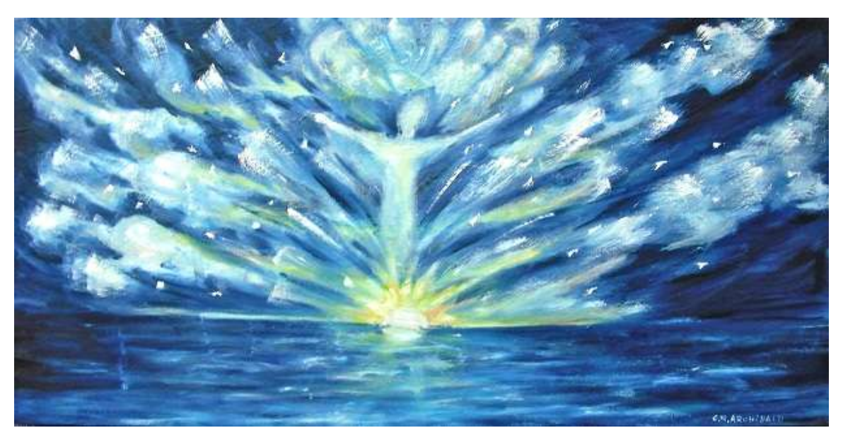
Artwork by Colleen Archibald