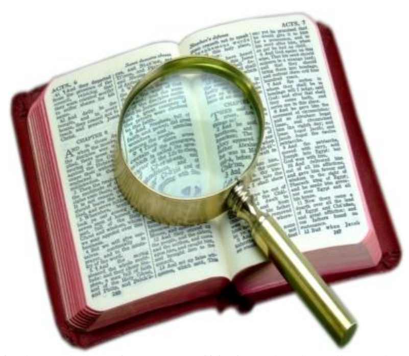
<u>Act 17:11</u> These were more noble than those in Thessalonica, in that <u>they</u> received the word with all readiness of mind, and searched the scriptures daily, whether those things were so.

We simply search the scriptures to see if in fact, what they tell us to be true is actually true according to scriptures. It is true that there are many interpretations