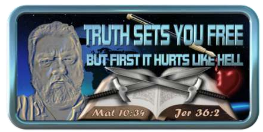
Piet Wilsenach South Africa