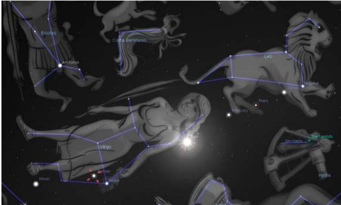
Figure 3: Date of Completion: September 23, 2017

The complete sign, as described by John in Revelation 12 is then fulfilled on September 23 rd , 2017, when Virgo, or the woman, is clothed with the sun, has twelve stars above her head and has the moon at her feet as shown in the image below: