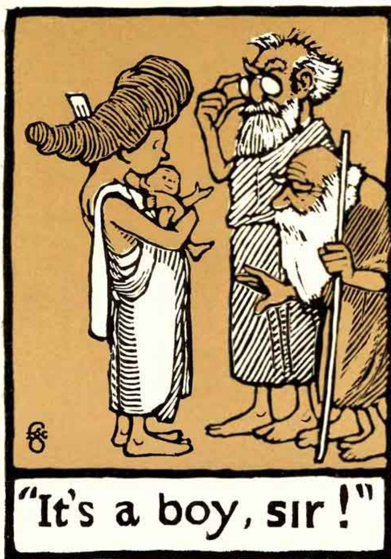
"It's a boy, sir!"

Incidentally I cannot forget the wise words of my father in this connection. He had always been an anti-suffragist, but when Aunt Jerusha's plan was laid before him he swung instantly around and became one of its heartiest advocates.