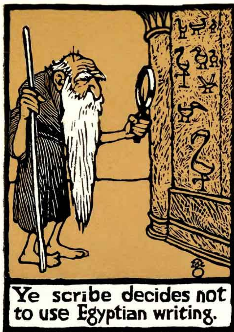
Ye scribe decides not to use Egyptian writing.

"I used to think so, my son, but under prevailing conditions I am forced into a more or less definite suspicion that it is elliptical, like a lemon." —Editor.