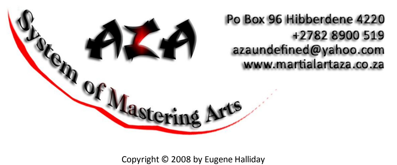
Copyright © 2008 by Eugene Halliday