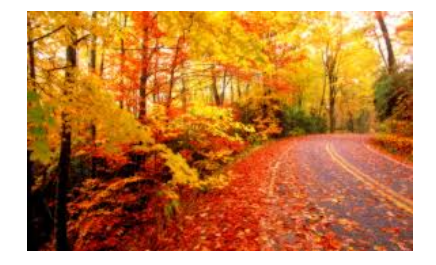
Figure : Red and gold of the Canadian maple in autumn