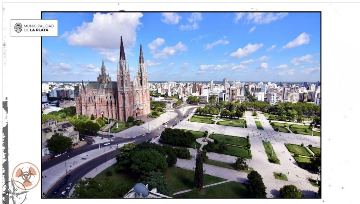
Image: La Plata, Buenos Aires

And to help dispel the myth of the United States as the wealthy white knight, here are the “low-income degenerate communist mud huts they liberated us from.” This was the neighborhood of Buenos Aires my parents called home: