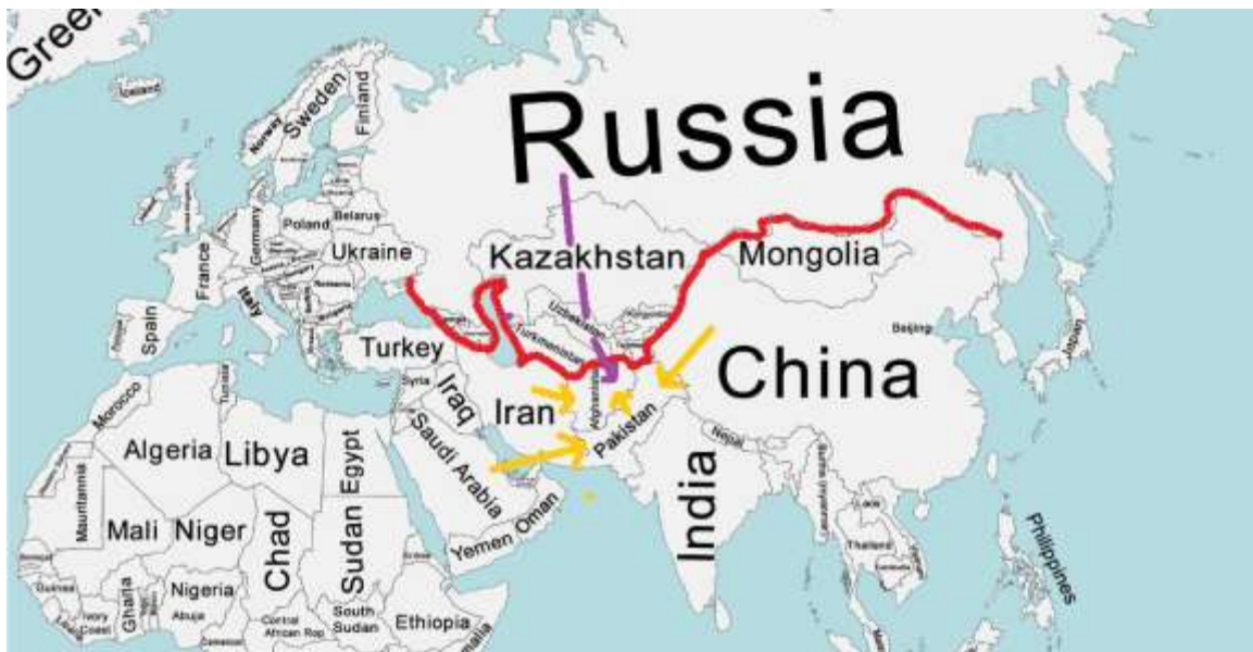
Map The Soviet Invasion and the Jihad Against the Soviets

After the Soviet invasion in Afghanistan there was enthusiasm in the Muslim world. All good Muslims wanted to go and kill the infidels. A Jihad against the Soviets would take place, and in 1989 the Soviets would have to leave from Afghanistan. In Afghanistan the Soviets had to fight with the Americans, the Chinese, the Arabs, the Iranians and the Pakistanis. It was the Soviets against everybody.