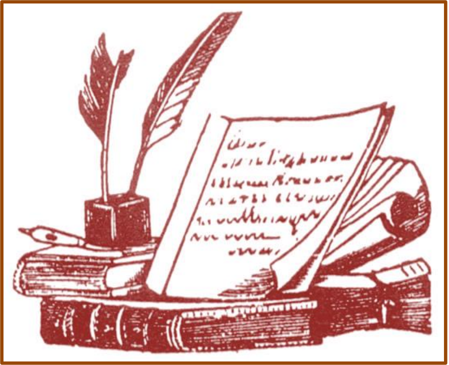
Figure from https://bit.ly/2EOqAHp