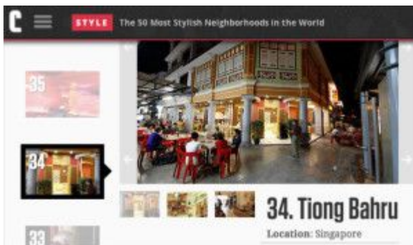
Top 50 Most Stylish Neighbourhood In The World

Tiong Bahru has been proudly voted as “One of the 50 most stylish neighborhoods in the World” by Complex Magazine for Top Travelers in the World. Such recognition has certainly brought much prestige and status, alongside Le Maris in France, Harajuku in Japan and SoHo in New York. Tiong Bahru is currently standing at 34 th position and is the only neighborhood in south east Asian that has made it to the top 50!