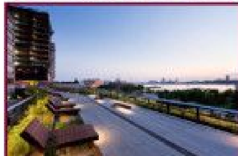
High Line Park In NYC

Highline Residences closely mirrors High Line Park in NYC which was once an abandoned railway track meant for transporting meat and dairy products to the docks. In April 2006, efforts were made to construct the park that would sit on the disused railway. Divided into a few phases, the once defunct railway was to be eventually transformed into a revitalized attraction for Chelsea, breathing new life into the once-rusty and forgotten metals. The park is now lined with swanky boutiques and world class upmarket coffee joints, creating a real estate boom in Chelsea. This is a sublime case of an old and almost forgotten history that had been dressed in new and modern fabrics to produce a magical charm, almost near impossible to be replicated.