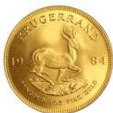
Buy Gold Bullion

Rare Gold is gold that is no longer being minted or gold coins that are minted in very limited supply. Popular or sought after rare gold include the Liberty Head minted from 1949-1907, St Gaudens minted from 1907-1933, European gold including Swiss 20 Franc and French 20 Franc. Rare gold has a two prong value based on both the value of their gold content and their collectible value. Rare gold has grown an average of 7500% since early 1900.