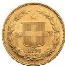
Buy Rare Gold

2. Perhaps the most overlooked way to invest in gold is the Gold IRA which has out performed almost all other paper investments such as real estate and the stock market.