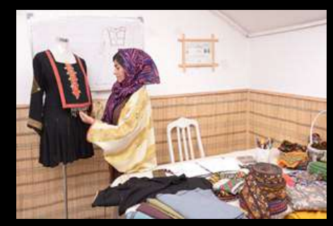
She is immensely proud to be an Afghan businesswoman and is also proud of the fact that she is able to contribute towards improving Afghanistan's economy situation.