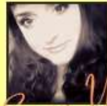
The Sassy Yank

"Music is passion & adrenaline rolled into a pattern of music notes that create a permanent etching of a moment in my mind."