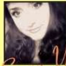
The Sassy Yank

"Music is passion & adrenaline rolled into a pattern of music notes that create a permanent etching of a moment in my mind."