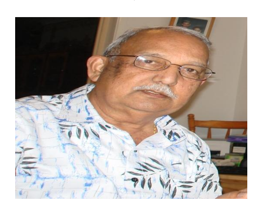
10 A Creation of The Prasad Family of Bellbowrie