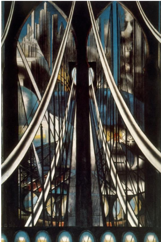
Joseph Stella, Brooklyn Bridge, 1919-20

By the start of the 20 th Century this pre-war art nouveau interior and architectural style, was to be superseded by the new art deco. An Italian immigrant Joseph Stella was fascinated by the geometric quality of the architecture springing up in 1920's New York.