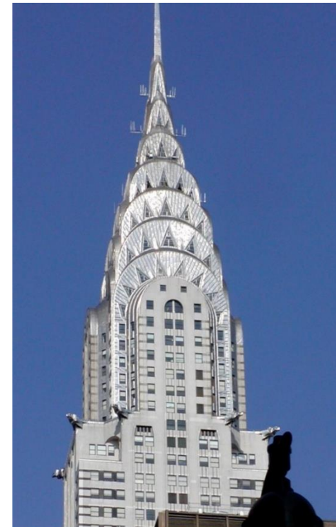
New York, Chrysler Building, Art Deco style, 1930

A new vibrant society and culture was emerging. An aspiration soon to die.