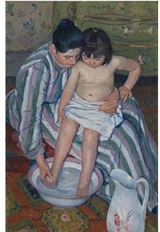
'The Child's Bath', Mary Cassatt, 1893

Mary made her home in France, but her work was exhibited in America and she did much to encourage American art dealers to buy Impressionist works, that had found so much favour after their earlier introduction in 1885. (Book 4)