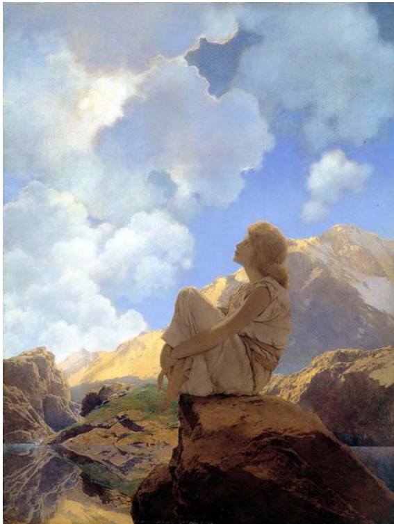
'Morning Spring', Maxfield Parrish, 1922

At the same time another 'illustrator', Maxfield Parrish, was realising great success with his vibrant paintings incorporating classical themes that were popular in the Art Nouveau fashion between 1890-1910. Starting with illustrations for children's books, he went on to design a cover for Harpers Weekly and became particularly popular for his annual calendars, which became collectors' items, with some selling more than 200,000 copies.