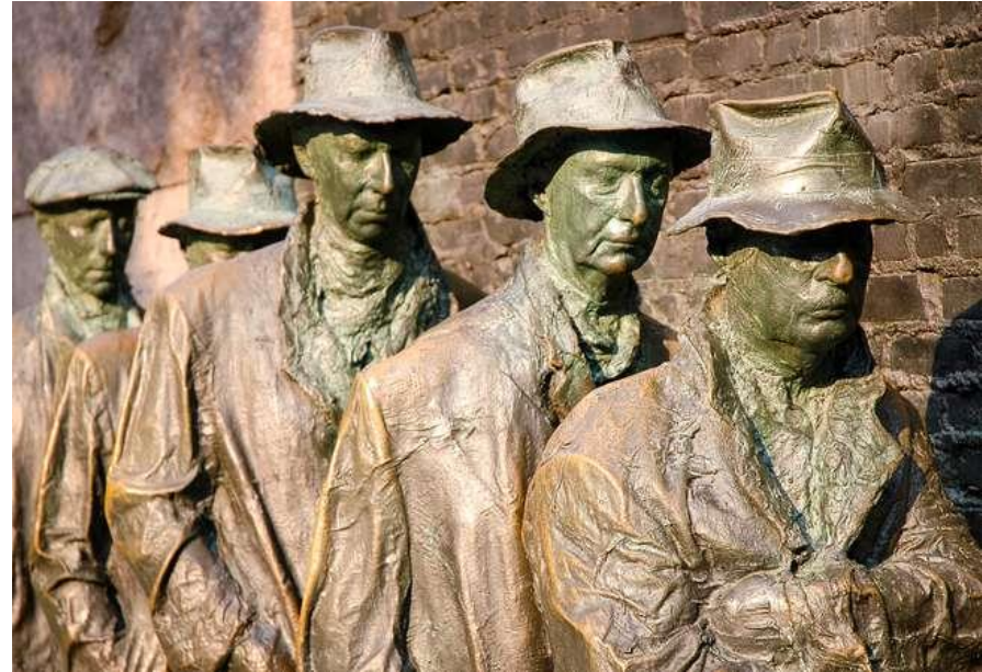
'The Bread Line', George Segal, 1991, FDR Memorial Washington DC

The end only came with a new President in Franklin D. Roosevelt (FDR) in 1933. He introduced the 'New Deal' as he delivered a massive injection of public monies to invest in infrastructure, supporting farmers and regulating banks. Dams and roads kickstarted employment and the moribund economy. This programme ran to 1936 and restored much of consumer confidence and although not immediately restoring jobs long term, realised a spirit of optimism.