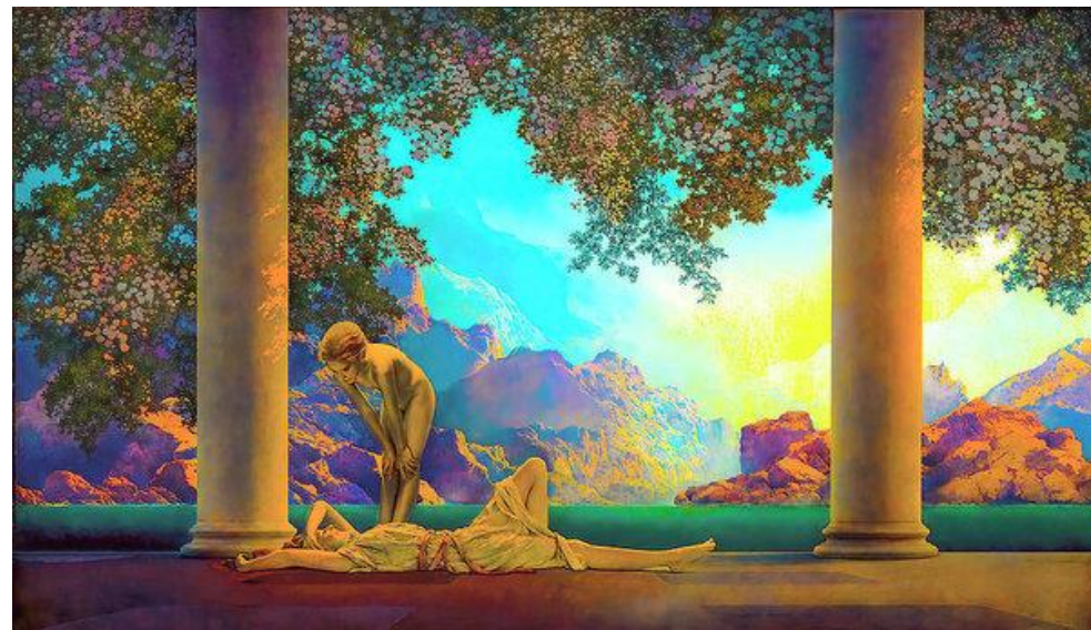
'Daybreak', Maxfield Parrish, 1922 (200,000 prints)

Parrish had a very precise technique, applying layer after layer of thin oil paint to the paper, with coats of varnish in between. The effect was highly detailed, producing luminous pictures, with his popular skies being termed 'Parrish blue'. The whimsical nature of his work chimed with the social themes of the time in the sinuous curves of Art Nouveau and the imagined settings. These also reflected the current fascination with a spiritual life conjured up in his works.