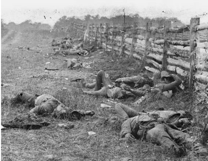
Battle of Antietam, 1862

Both sides immediately introduced conscription, raising armies from civilians and setting the North-South divide. The Confederate armies gained the early victories, destroying larger Northern 'Union' armies. But the Southern Confederacy lacked the resources of the North and the tide began to turn with the Union General, Ulysses Grant engineering gains in the west. At the bloody battle of Gettysburg in 1863 General Robert E. Lee's Confederate army was defeated and the South fell into retreat.