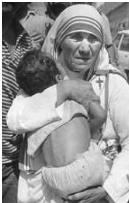
MADRE TERESA DE CALCUTÁ