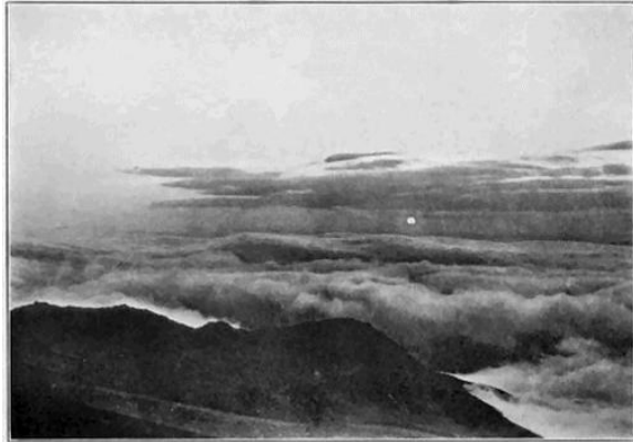
Sunrise from the summit of Mount Washington