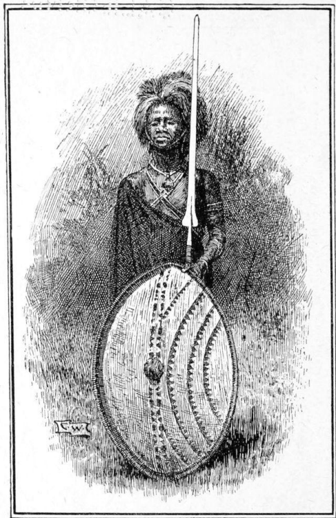
MASAI WARRIOR WITH LION-SKIN HEAD-DRESS.