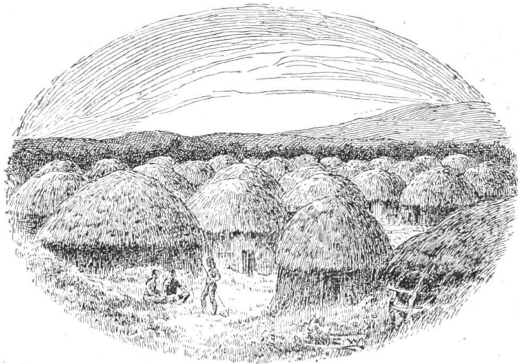
A MASAI VILLAGE.