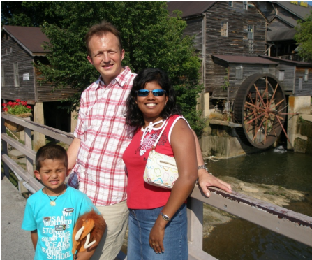
Figure 5: Trees must have roots. To American students and foreigners studying in America, it's essential to understand the country's history in all its aspects. This picture was taken at Pigeon Forge in Tennessee, in 2006.

express his profound appreciation for his fabulous students and will continue to open their minds and horizons by teaching them science and technology framed in a historical and global context. Creating future engineers is a real honour, and a contribution to their holistic personality is a pleasure.