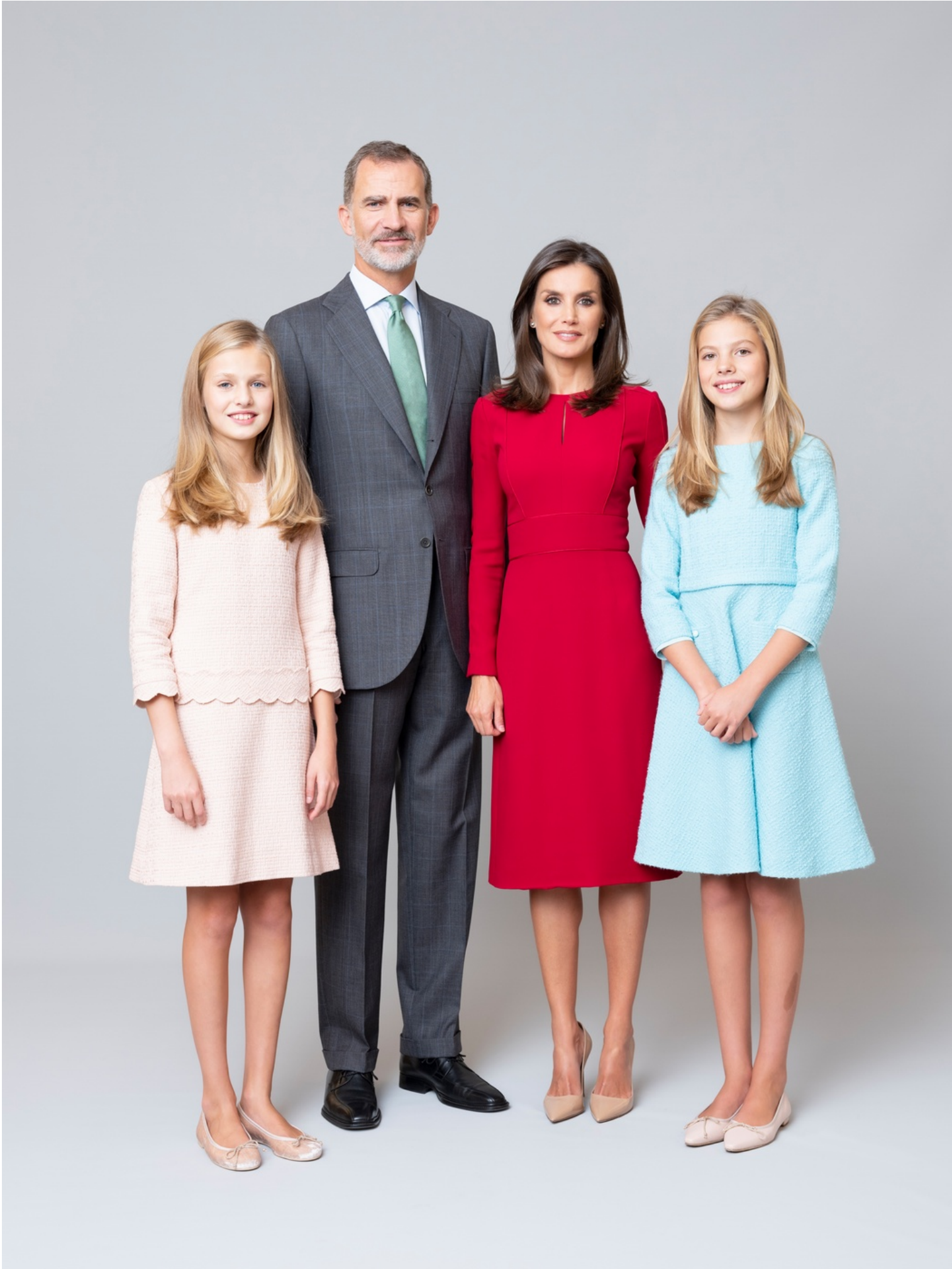
Figure 1: Sus Majestades los Reyes junto a Sus hijas Sus Altezas Reales la Princesa de Asturias y la Infanta Doña Sofía