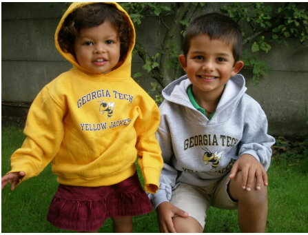
Figure 4: When Georgia Tech had just hired the author in July 2006, he brought back some Yellow Jackets items for his children, a tradition which he has always respected upon each visit.