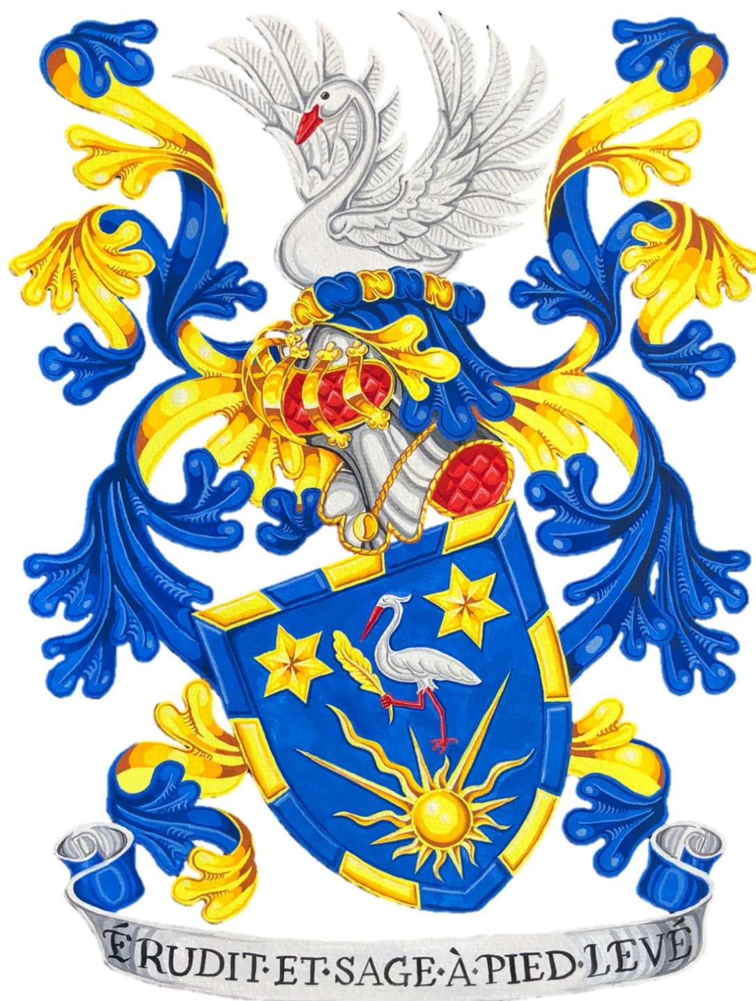
Figure 2: The Coat of Arms of Nico F. Declercq and his descendants. Artwork by Björn Fridén, Swedish Heraldic Artist. (Nico F. Declercq, © 2020, all rights reserved)