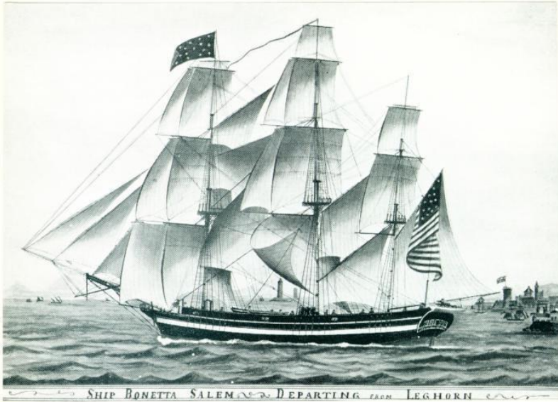
SHIP BONETTA SALEM DEPARTING FROM LEGHORN