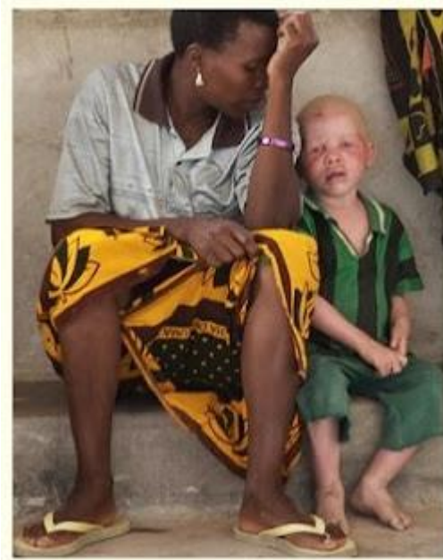
Tanzanian mother and her albino child

Exploring the history of albinism in Africa is of utmost importance for several compelling reasons. Africa, a continent rich in cultural diversity and ancestral traditions, has fostered a wide range of beliefs, customs, and folklore surrounding albinism for centuries. By delving into this history, we can gain profound insights into the beliefs, values, and social dynamics that have shaped the African narrative surrounding albinism. Also, monitoring how pale skinned people were generally treated in Africa empowers us to resolve recent concerns influencing individuals with albinism, like disgrace, segregation, and unfortunate admittance to medical services and schooling. We can create a more accepting and enlightened future by shedding light on the past.