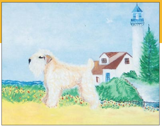
Beach Illustration by Syd

To learn about support groups, services, research centers, clinical trials, and publications about AD, contact the following: