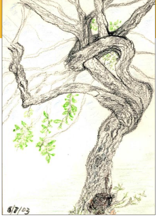
Tree Illustration by Jenny

More and more resources are available to help people