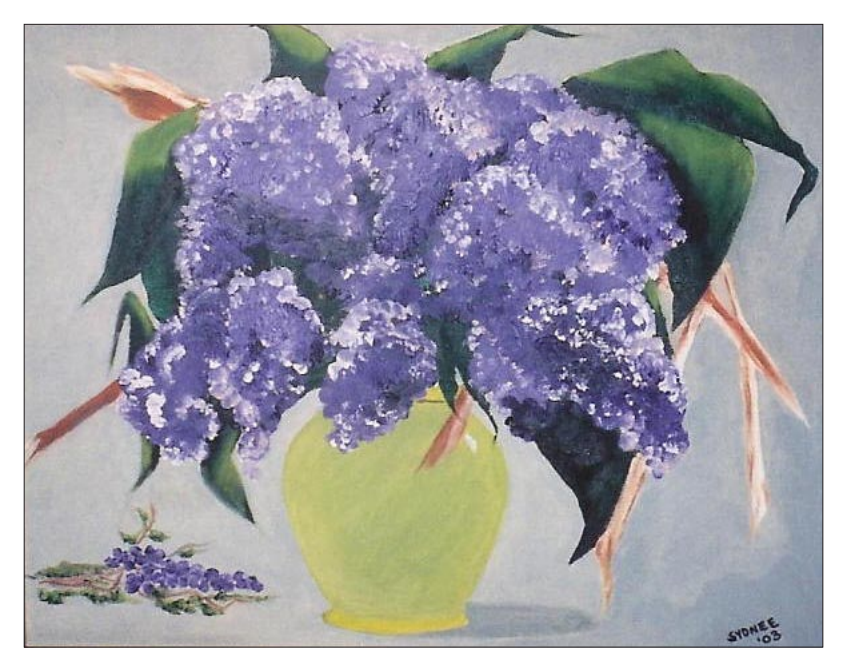
Flowers Illustration by Syd