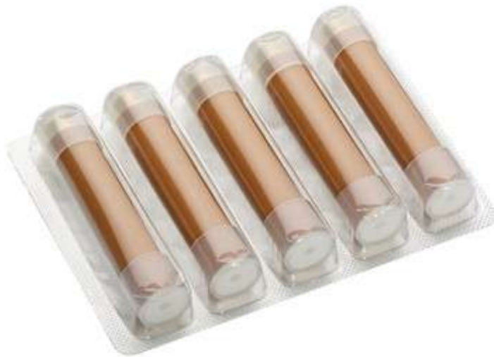
Halo Refill Cartridges

A recent innovation has been to make the atomiser and the cartridge into a single piece. The Halo cartridge is an example of this. The innovation both makes it easier and quicker to assemble the electronic cigarette and reduces atomiser failure.