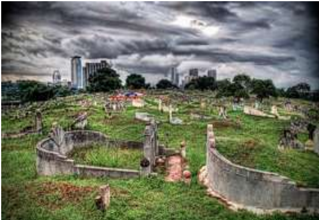
Chinese Cemetery: Stuck in Customs

But then he watched his father die of lung cancer.