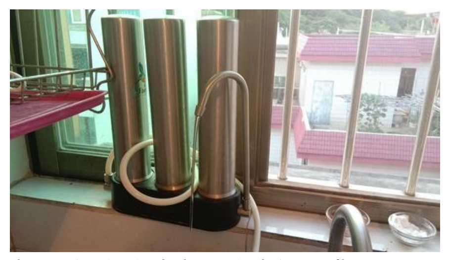
Three stages (ceramic, activated carbon, ceramic+silver) tap water filter.

If you live in a big city or an industrial place, your tap water is probably dead and so poisonous that it is not suitable for drinking or bathing. Using water bought in plastic containers is not a healthy solution either. Filtering water with properly constructed filter is relatively simple and efficient solution.