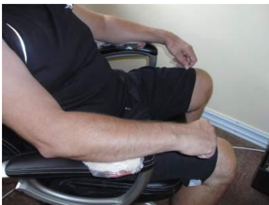
Above: Forearms resting on putty filter with materials underneath.

It's easier to bandage the materials to the ankles first then rest the forearms on the putty filters and materials while resting on a bed or reclining chair.