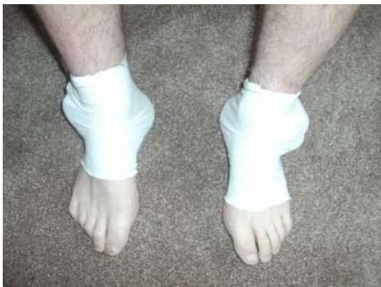
Above: Materials on ankle joint held in place by a support bandage.