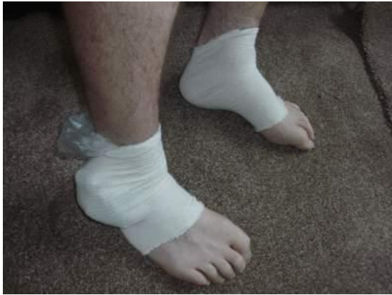
Above: Side view of materials on side of ankle joint.

It's easier to bandage the materials to the ankles first then rest the forearms on the putty filters and materials while resting on a bed or reclining chair.