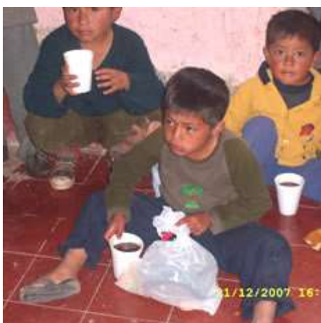
Children SYMBOL of San Juan

To raise money to start this project I have created several natural products that I attempt to sell online. Your support will be valuable for me, please review the entire report and if it is useful to you, come back here and DONATE $ 1 or the value of a plant ($10) or the amount that your heart commands to you.