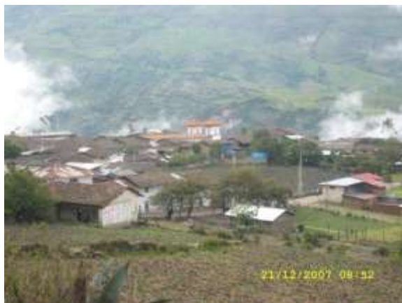
San Juan of Yanac